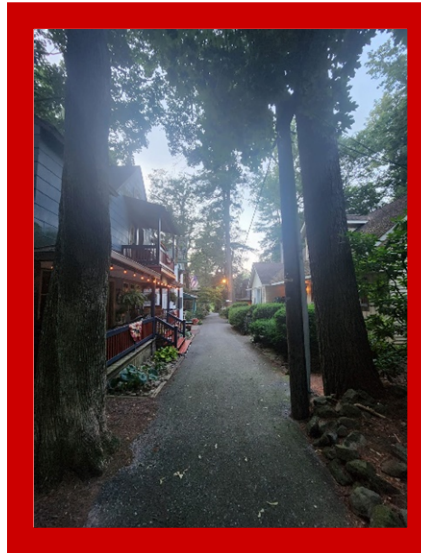
Submitted by Charity Lorenzen