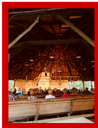
Submitted by Kevin Burd