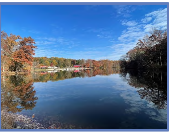
Submitted by Jim Erdman