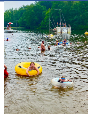
Submitted by Leeshawn Musick