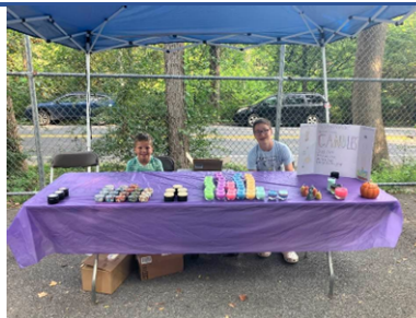
Submitted by Pat Wilmsen